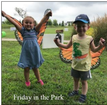
Friday in the Park