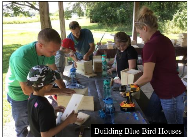
Building Blue Bird Houses