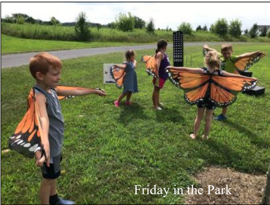
Friday in the Park

Pickaway SWCD, OSU Extension, Parks District, and Solid Waste District partnered again this year to provide activities for our Friday. Our theme was "Nature Around the World."