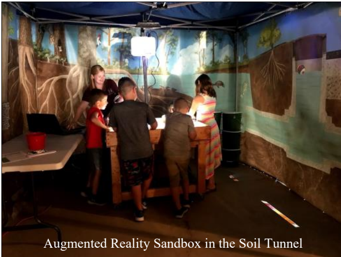
Augmented Reality Sandbox in the Soil Tunnel