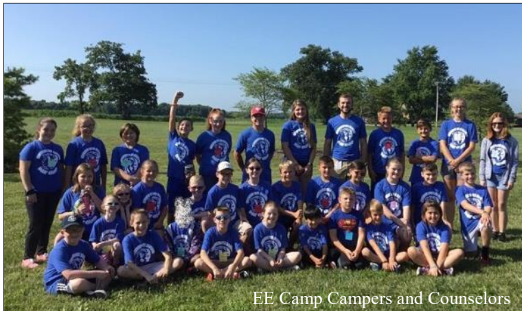
EE Camp Campers and Counselors

We were happy to host our Experience Earth Day Camp on July 23-25 at Mary Virginia Crites-Hannan Park. 30 incoming fourth and fifth grade students came out to learn about honey bees, archery, soil, monarch butterflies, rocks, wildlife, recycling, forestry, blue birds, macro-invertebrates, insects and so much more! There were many community agencies and volunteers who lead session and helped to make EE Camp a lot of fun for our students. Thank you!